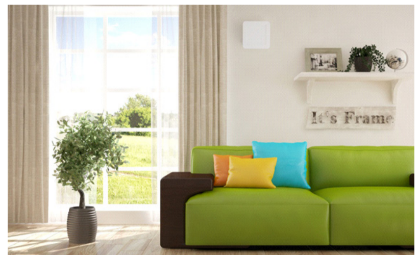
KORASMART TUBE 2400E