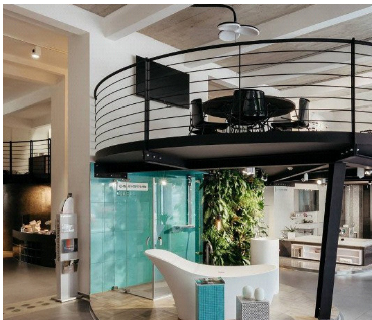
Showroom Křižíkova - Praha