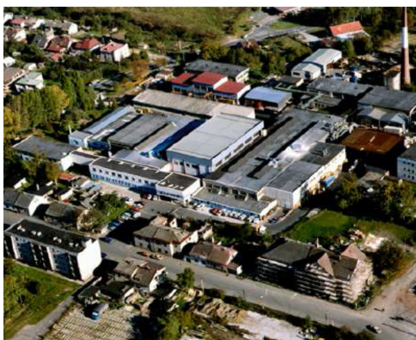
Závod KORADO v roce 1995

This year, KORADO a.s. celebrates 30 years since its establishment and at the same time 55 years since the establishment of the former Koventa. It only remains to wish the company many years of smooth production to come, millions of manufactured radiators and satisfied customers around the world! ■