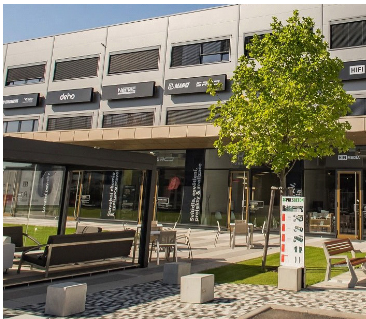
Showroom Kaštanová - Brno