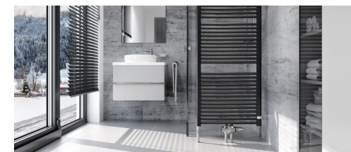
KORALUX - spatial mounting

Heating towel rails have become an essential part of a modern bathroom. Nowadays, there are bathroom rails of many colours and shapes on the market, so you can easily match them with the rest of the space. But it may be new for you that KORADO also offers an option of original and practical spatial mounting for all its bathroom radiators thanks to the wall brackets. Thanks to this, the heat source can suddenly become a practical partition which optically separates, for example, the toilet space. ■