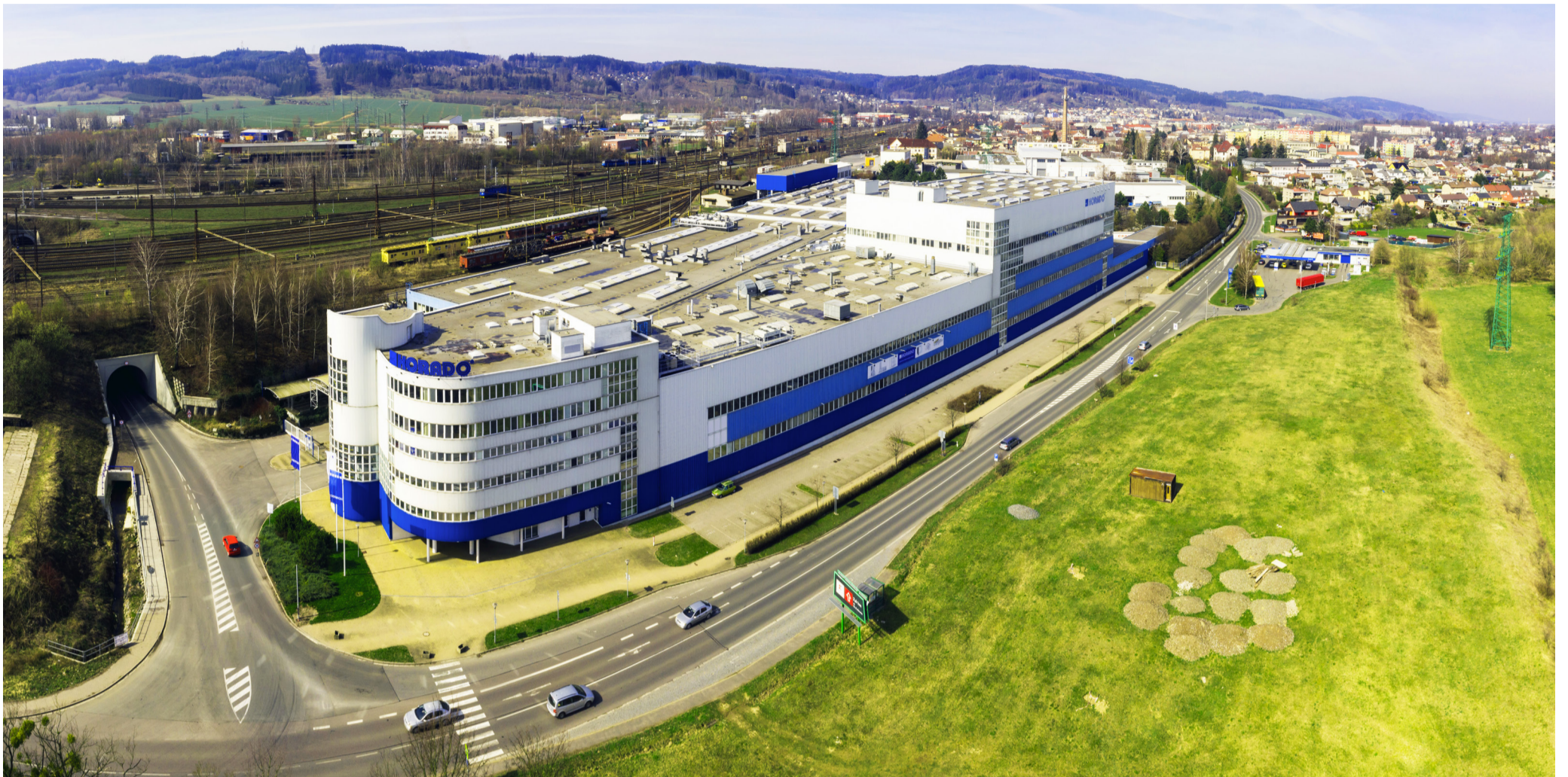
New KORADO plant - aerial view

SPECIAL EDITION 2020 ■ MARKETING MATERIAL OF KORADO A.S. ■ TEXTS AND PHOTOS: KORADO INTERNAL MATERIALS AND AUTHORS ■ PRINT: HRG LITOMYŠL ■ PRICE: FREE