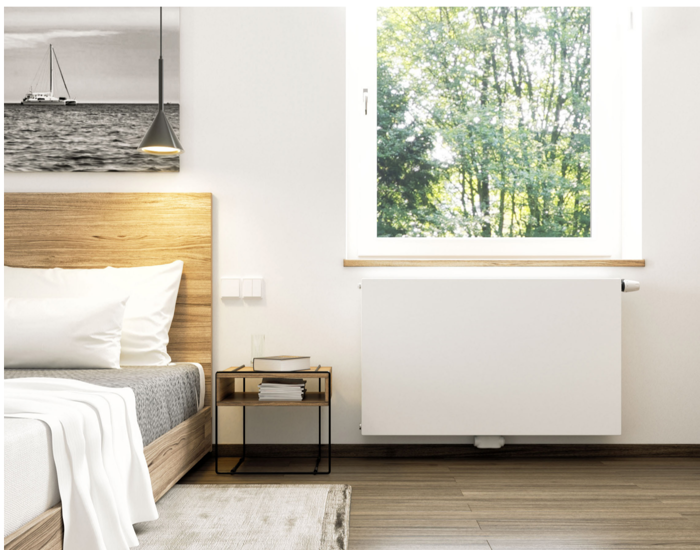
RADIK PLAN VKM8

PLAN and LINE versions can also be produced directly. ■